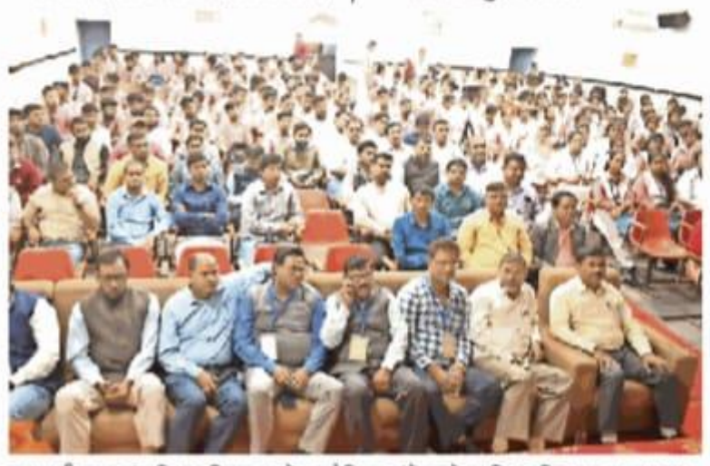
महारानी लाल क्वरि महाविद्यालय में आयोजित कांक्रेस में उपस्थित शिक्षक

देश के कई हिस्सों से आए 600 प्रतिभागी हए शामिल