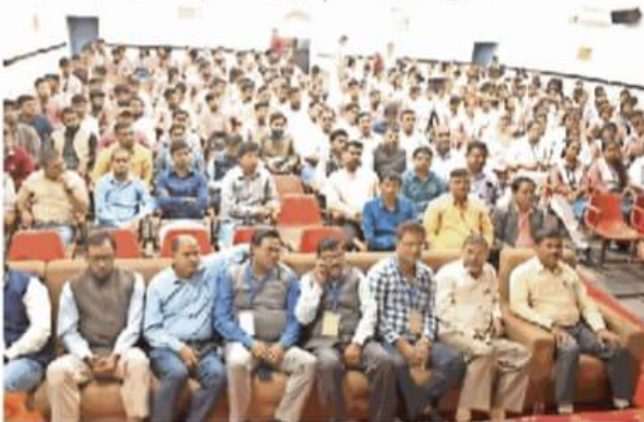
महारानी लाल कुंवर महाविद्यालय में आयोजित कॉन्फ्रेंस में उपस्थित शिक्षक

● देश के कई हिस्सों से आए 600 प्रतिभागी हुए शामिल