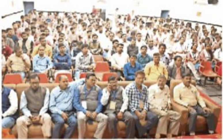
महारानी लाल कुंवर महाविद्यालय में आयोजित कॉन्फ्रेंस में उपस्थित शिक्षक

● देश के कई हिस्सों से आए 600 प्रतिभागी हुए शामिल